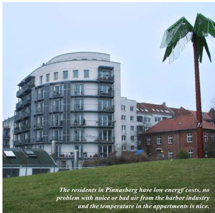
The residents in Pinnasberg have low energy costs, no problem with noise or bad air from the harbor industry and the temperature in the apartments is nice.