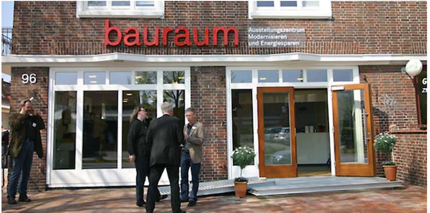
The formal opening event on 15th of April was accompanied by politicians, members of the founding institutions and many supporters.