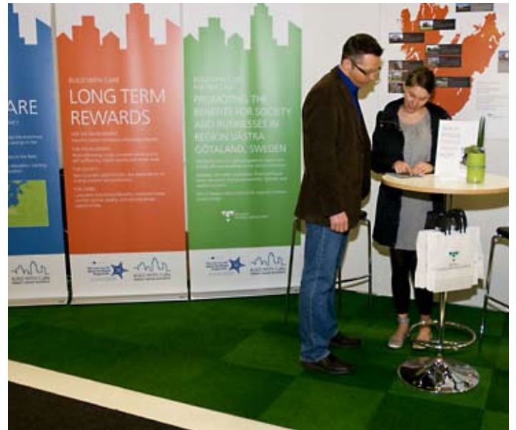
EnBo provided a unique opportunity for networking and sharing knowledge on the theme of energy efficient buildings.

The second Nordic Passive House Conference was organised in Gothenburg during the same week. Fourhundred participants had the opportunity to listen to interesting speakers from all over Europe. The second day of the conference was devoted to study visits and EnBo was, of course, on of the stops.