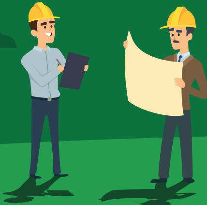
TRAINING TECHNICIANS OF THE FUTURE