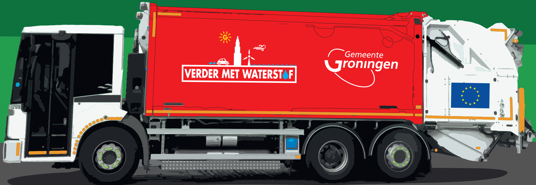
DEPLOYING HYDROGEN VEHICLES