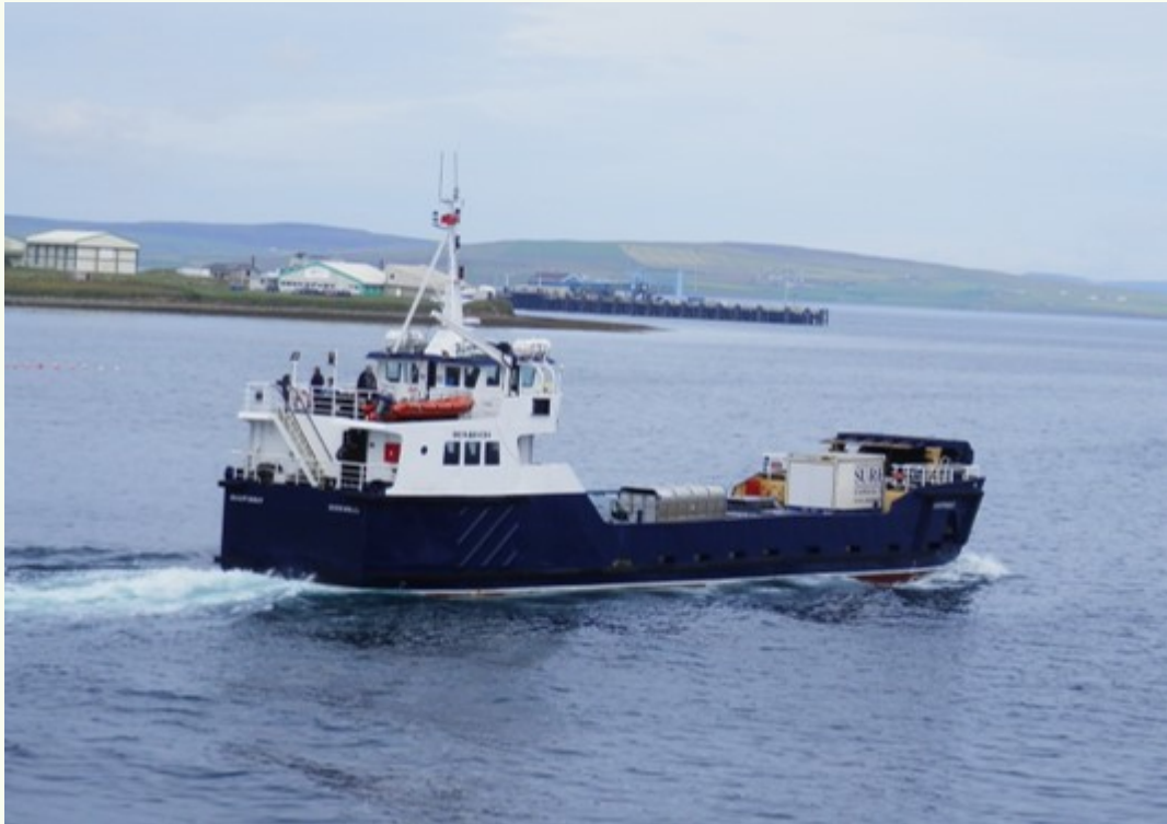
The MV Shapinsay - subject of the first training course

In cooperation with Orkney College Marine Studies, Orkney Islands Marine services has created a Hydrogen training course to ensure that marine crews are able to bunker and to operate hydrogen-powered vessels. To be more specific, attendees who complete the training course, will be skilled to operate the world's first hydrogen dual fuel RoPax ferry – a part of the HyDIME project . Among other training subjects, attendees will also be trained in responding and dealing with ships fire on a hydrogen-powered vessel as well as detecting gas.