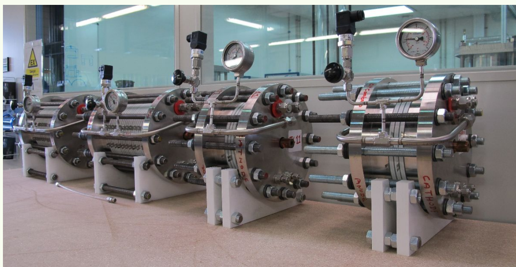
Electrolyser from ITM Power

modular 5-Megawatt electrolyser stack, whereby Orsted has investigated the potential synergies with offshore wind farms. During the second phase, the partners will detail the actual design of a hydrogen production system, connected to an offshore wind farm and an industrial off-taker, utilizing ITM Power electrolyser stack technology.