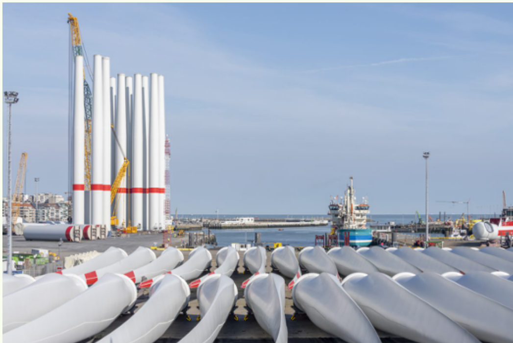
Port of Oostende

Together, they have launched the HYPOR project. The aim of this project is to open a green hydrogen production plant at the port of Oostende. The green hydrogen will be used as an energy source for heating or transport, and another part will be used as a resource that will be connected to CO 2 for the production of methanol.