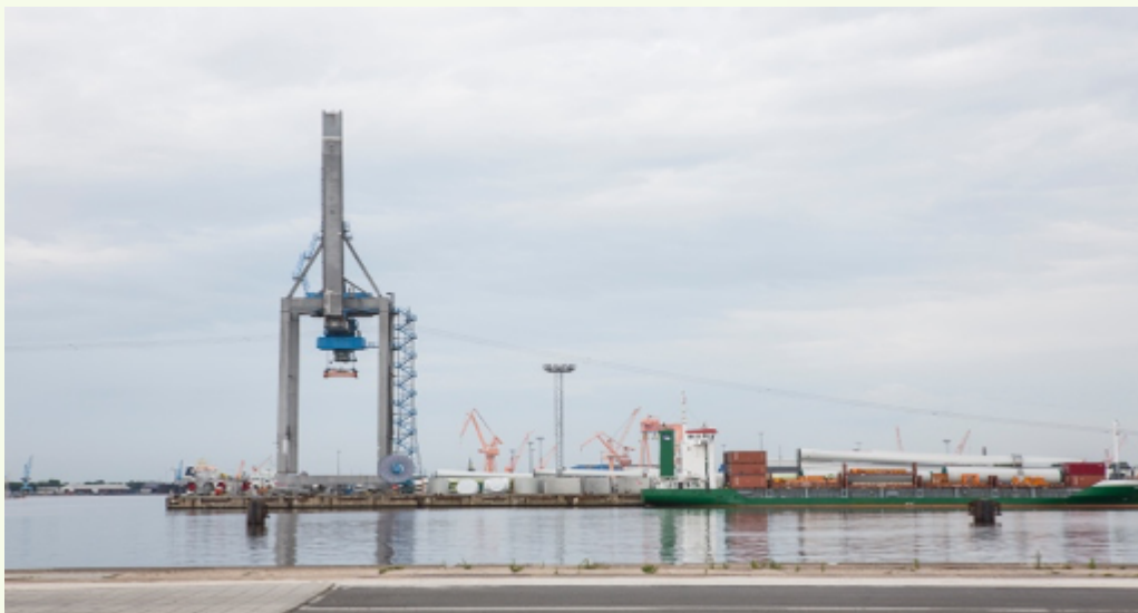
Port of Emden

Please find access to the full presentation (in German) here.