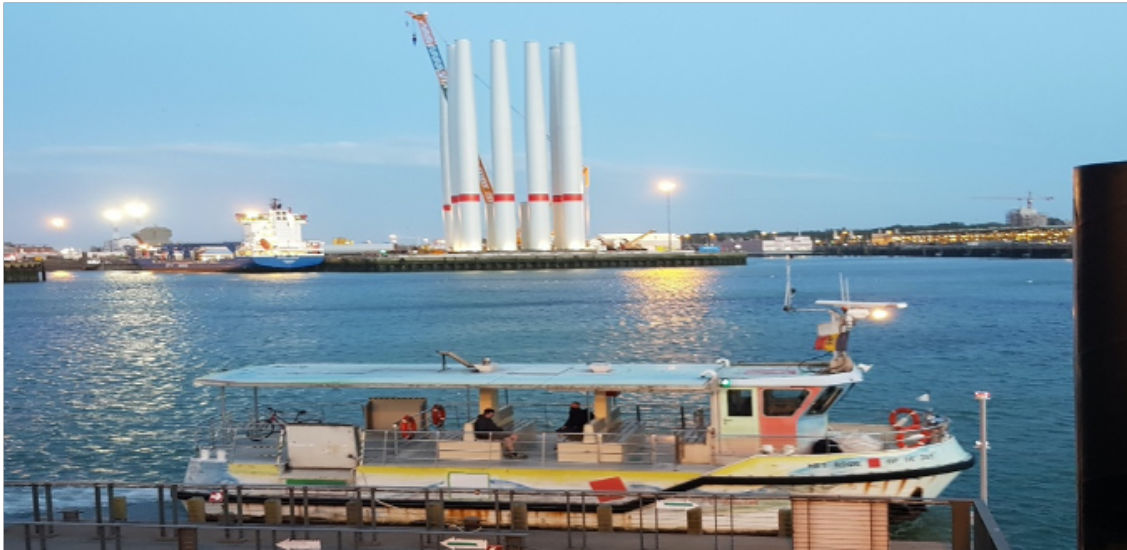
Port of Oostende