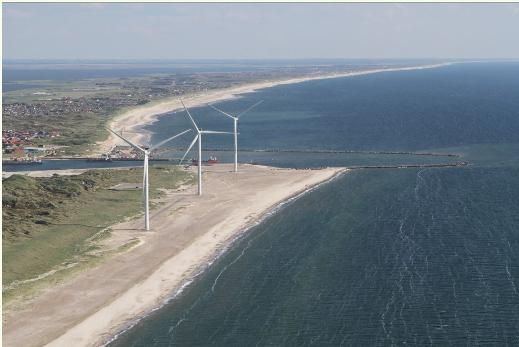
Windmills at the Port of Hvide Sande

based on the approx. 20,000 MWh excess electricity from the three wind-turbines at the port area.