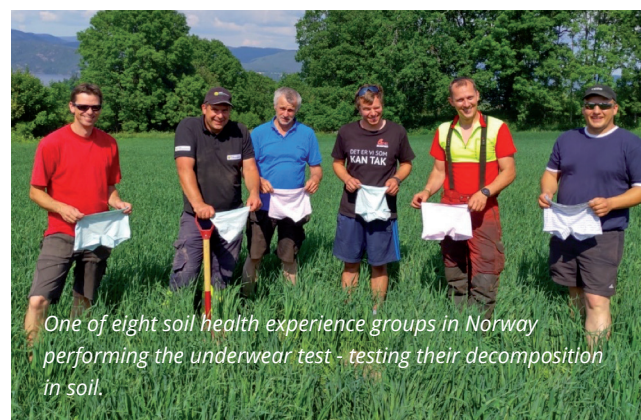
One of eight soil health experience groups in Norway performing the underwear test - testing their decomposition in soil.

This leaflet contains ideas and information on measures you can take to combine food and biomass production with Carbon Farming. Important is a constant and consequent management on your farm, due to the reversibility of SOC binding. Best is to try a combination of different new approaches!