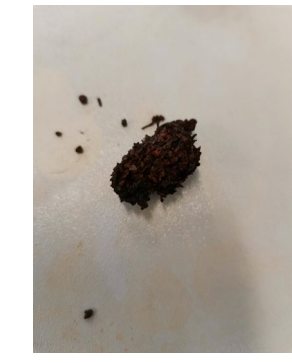
ZVI fast surface passivation could be a limittion factor for the filter system