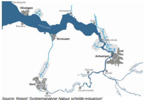
Source: Report 'Systeemanalyse Natuur sch (Illustrations by Zuidhof A., rvo.nl)

The Scheldt is a 355 km long river flowing across France, Belgium and the Netherlands. It can be divided into the non-tidal Upper Scheldt and the tidally influenced Scheldt Lower which includes the Flemish Sea Scheldt (from Gent to the Belgian-Dutch border) and the Dutch Western Scheldt (from the border to the mouth at Vlissingen). The Flemish Sea Scheldt is further divided in the Lower Sea Scheldt (from the border to upstream Antwerp) and the Upper Sea Scheldt (from Antwerp to upstream Gent).