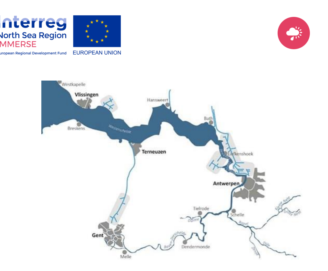
Source: Report 'Systeemanalyse Natuur schelde-estuarium' (Illustrations by Zuidhof A., rvo.nl)

In the Flemish Lower Sea Scheldt sandy material is currently dredged from the sills of the fairway and transported to the relocation site 'Schaar van Ouden Doel'. This submerged relocation site is protected from high water current velocities by a dam. The capacity of the site is maintained by allowing commercial sand extraction in a similar volume as the annual volume of sand that is brought in from dredging activities.