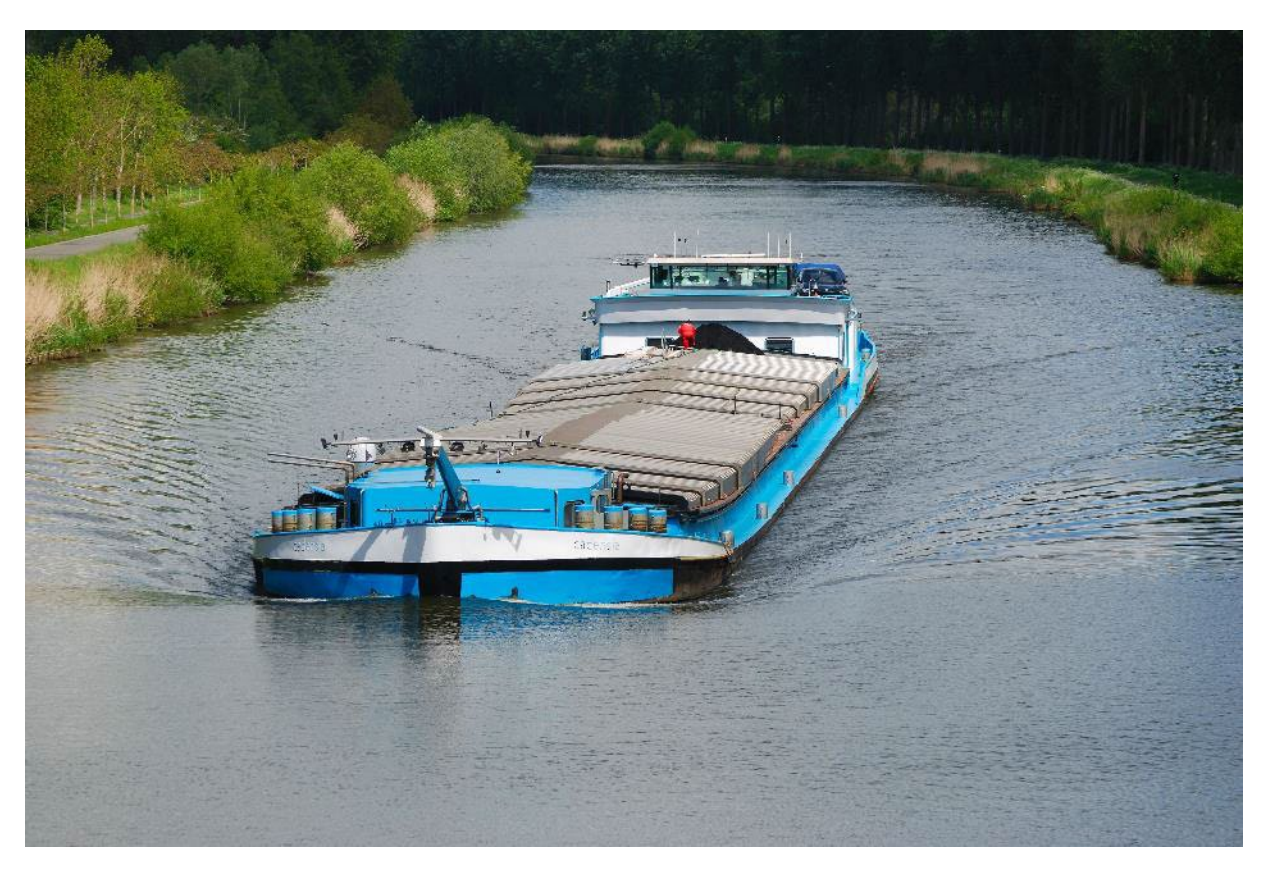
Figure 1: Inland waterway vessel