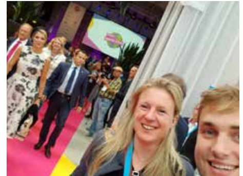
SHINE's mid-term conference was attended by the Queen Maxima of the Netherlands.