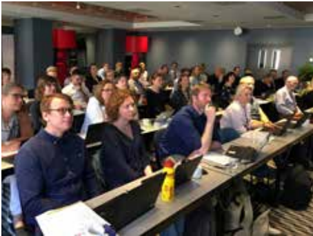
The Secretariat organised 7 reporting training and First Level Control seminars.

Flanders, Geert Bourgeois, who called for an integrated strategy for the North Sea. In addition, we organised 7 training events supporting our project community to implement projects. Programme staff also participated in numerous events organised by projects.