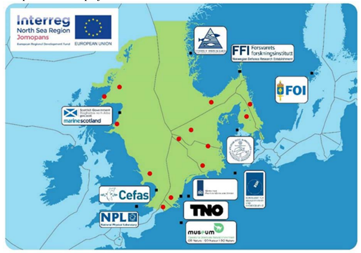
Fig. 1: JOMOPANS monitoring stations (red dots) and project partners.

This project will deliver a combination of modelling and high quality measurements at sea for an operational joint monitoring programme for ambient noise in the North Sea. The use of consistent measurement standards and interpretation tools will enable marine managers, planners and other stakeholders internationally to identify, for the first time, where noise may adversely affect the North Sea. The project will explore the effectiveness of various options for reducing these environmental impacts through coordinated management measures across the North Sea basin. Figure 1 shows the location of the 14 JOMOPANS monitoring stations and the partners on the project.