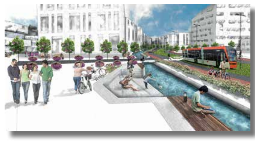
Planned transformed Minde city with BGI