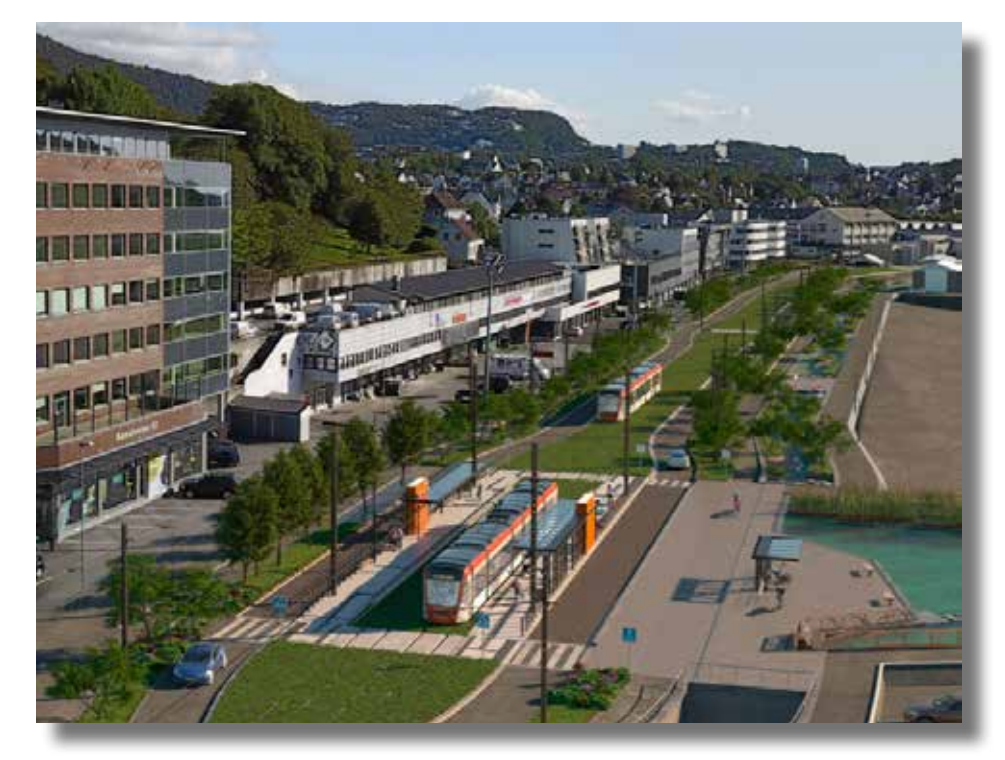
Light Rail station in transformaed Minde City