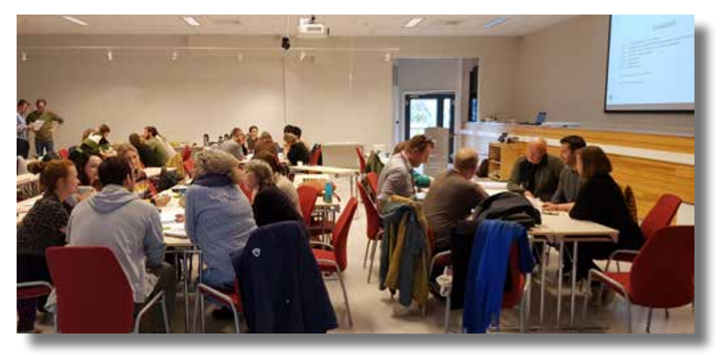
Interdisiplinar seminar on our new Storm water masterplan