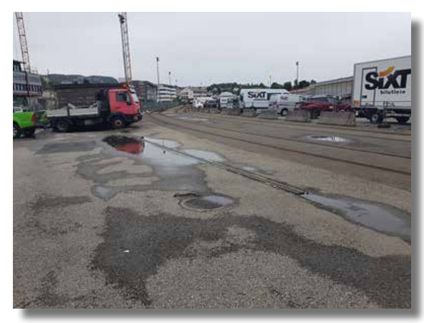
Todays situation at Mindemyren