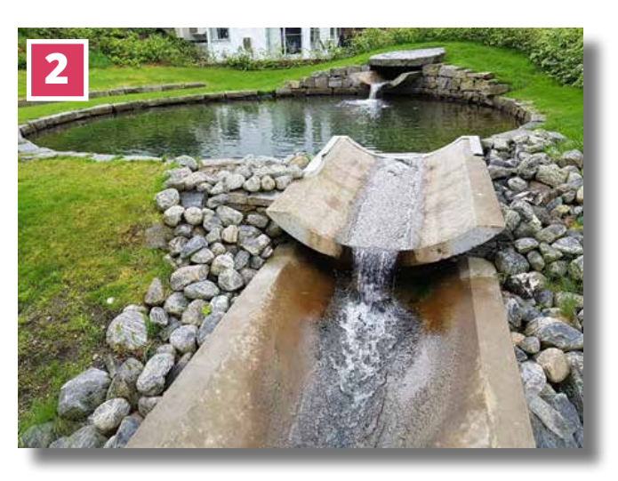
The Top BGI-system